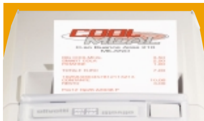
receipt printed in two colors: red and black